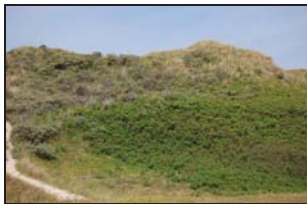
H. rhamnoides and R. rugosa

Vlieland is one of the West Frisian barrier islands, situated in the North of the Netherlands. The Natura 2000 area 'Duinen Vlieland' protects most of the island. Especially the 'grey dunes', characterized by sandy slopes of lichens and open species rich vegetation, are a key habitat type. The management objectives are focused on increasing the quality and area of the 'grey dunes'.