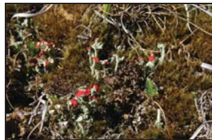
P. serotina sprouting