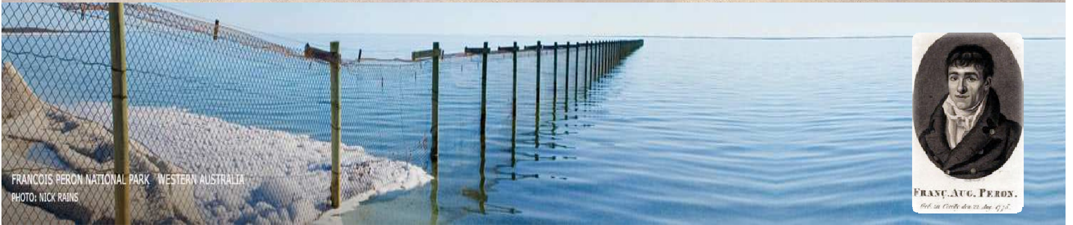
FRANCOIS PERON NATIONAL PARK WESTERN AUSTRALIA